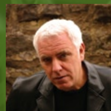
Dave Spikey, Comedian/Writer

"So the Government has given badgers a 9 month reprieve? Simply not good enough! We need a full pardon for the little stripy fellas, and repeal the death sentence NOW. The cull has never made any sense, so can we put a stop to it once and for all? Please."