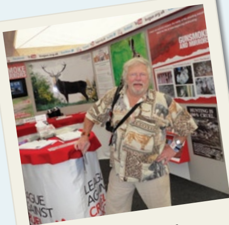
Bill Oddie joins local group volunteers at the Bird Fair