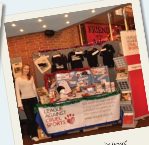
Animal Aid Christmas Without Cruelty Fair